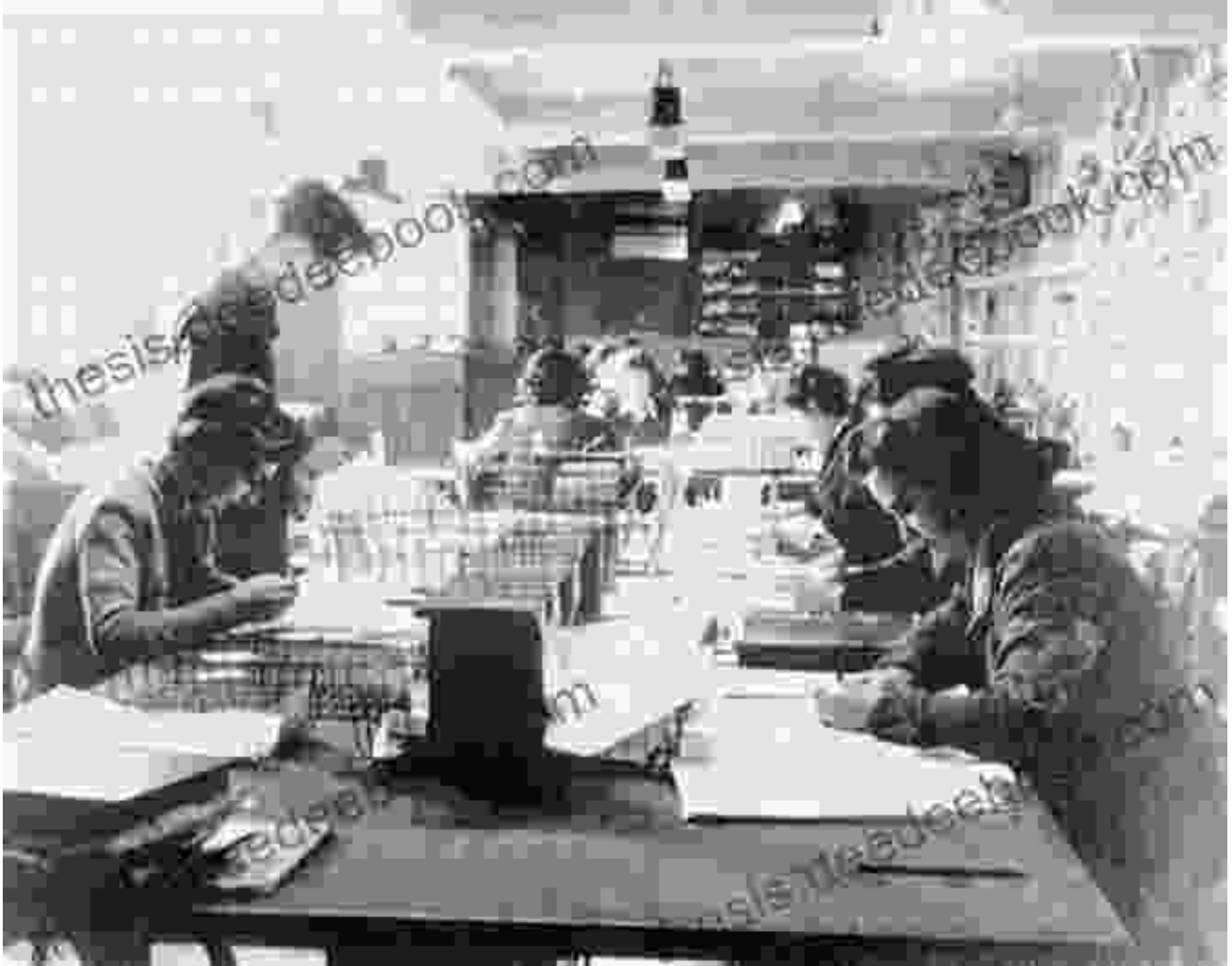
Bletchley Park, the secret British codebreaking centre during WWII.

Quinn's extensive research is evident in every chapter, but she never allows historical details to overshadow the human story at the heart of the novel. Instead, she uses history as a backdrop to explore the complexities of human nature, the moral dilemmas faced in times of war, and the resilience of the human spirit.