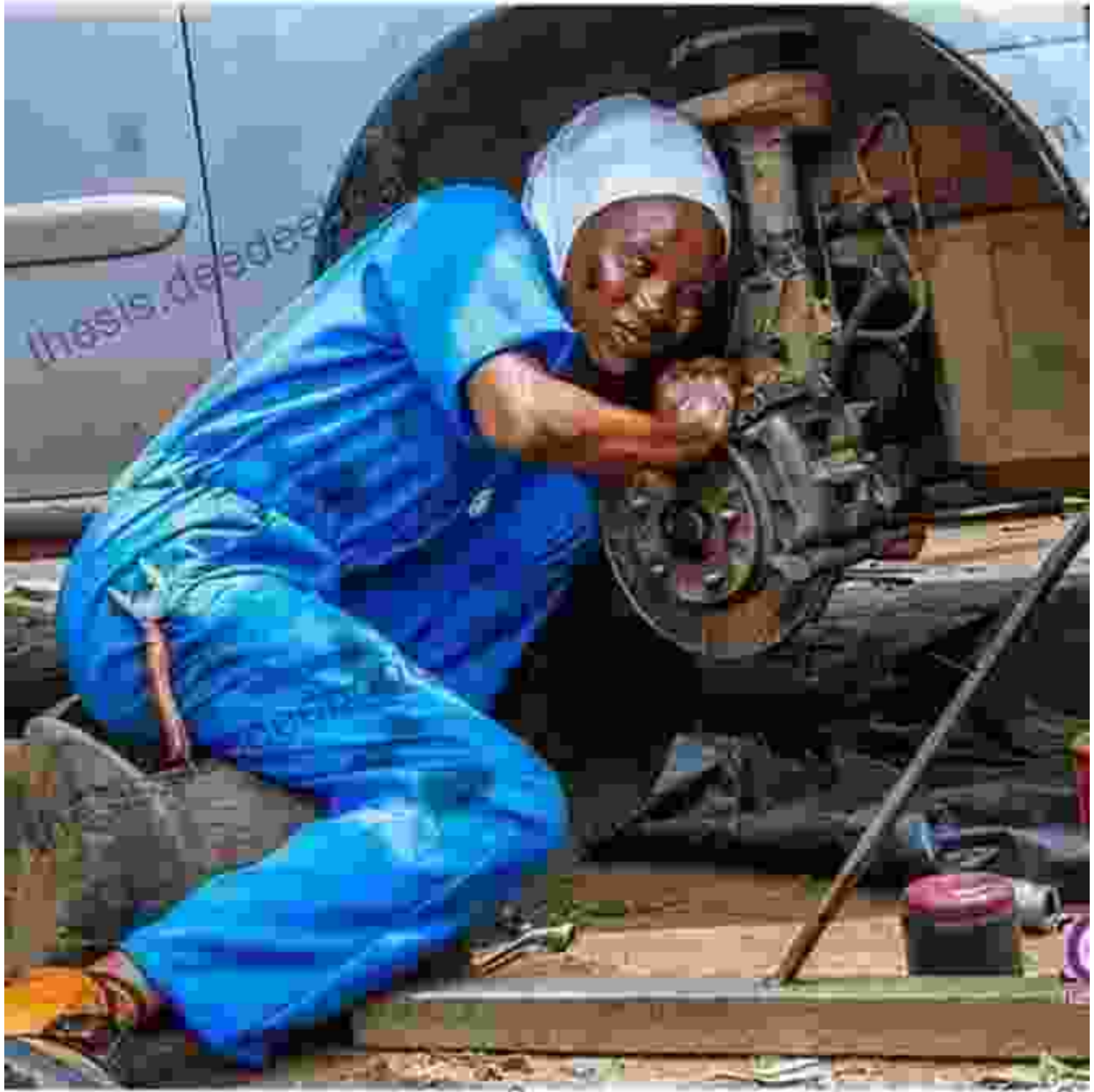
A Nigerian mechanic at work