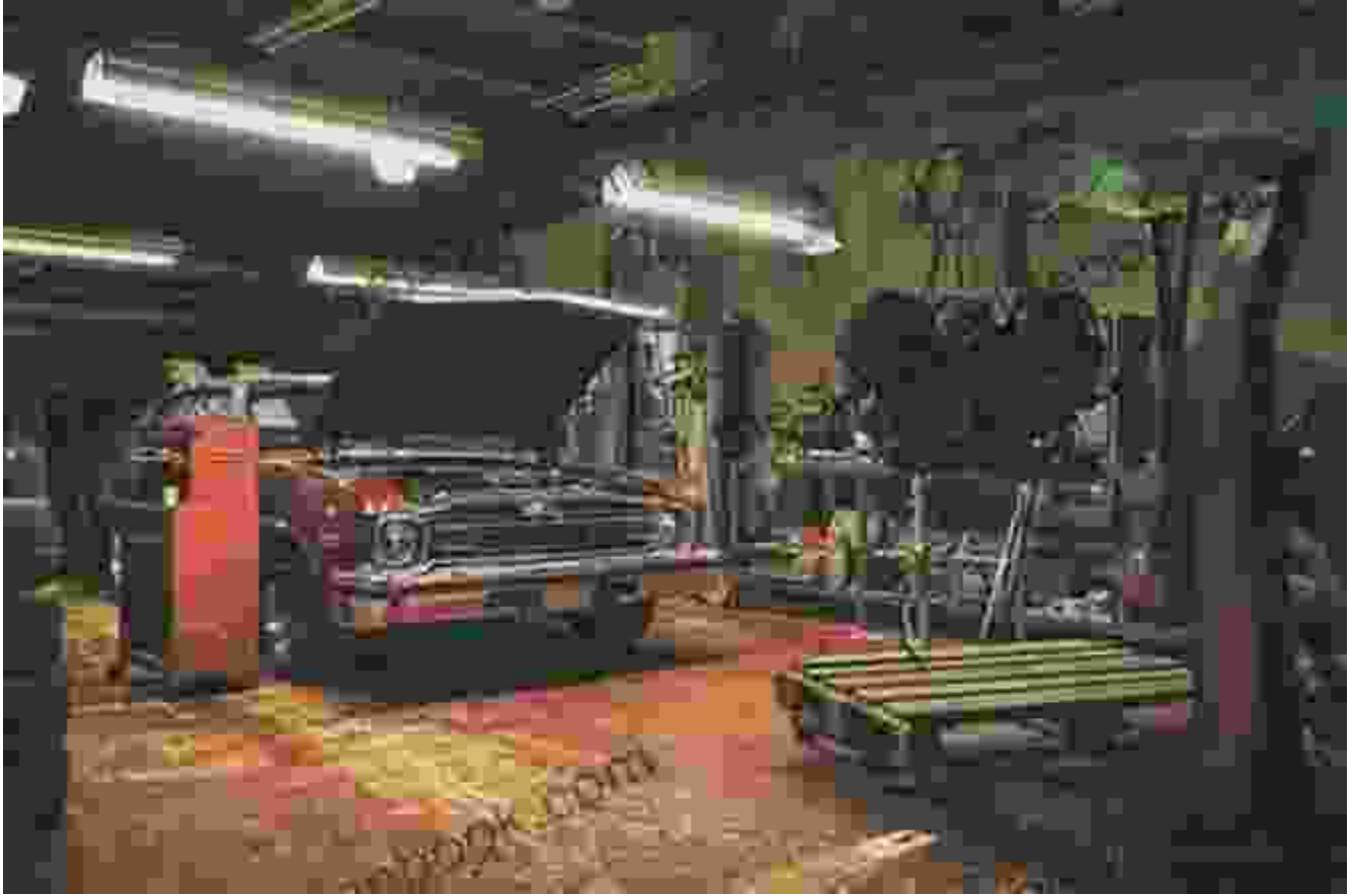
The bustling environment of a mechanic's workshop