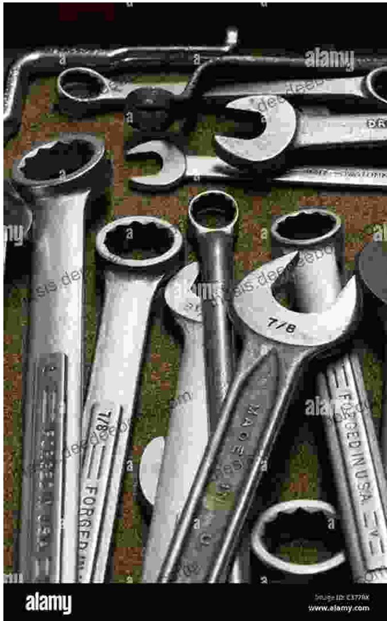
The tools of the trade