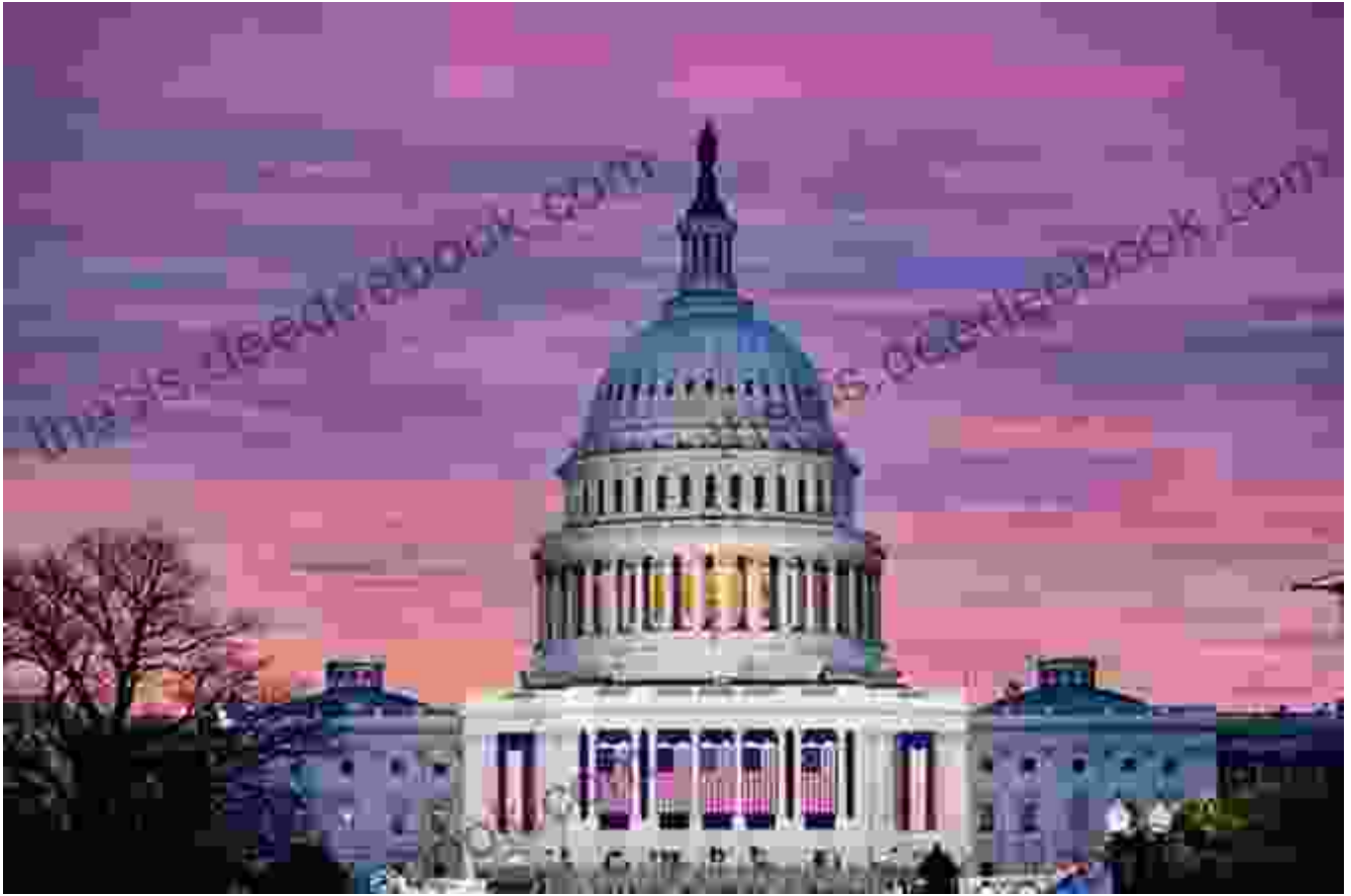
United States Capitol Building