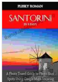
Photo Travel Guide: Using Google Maps to Locate the Perfect Photo Shot Spots