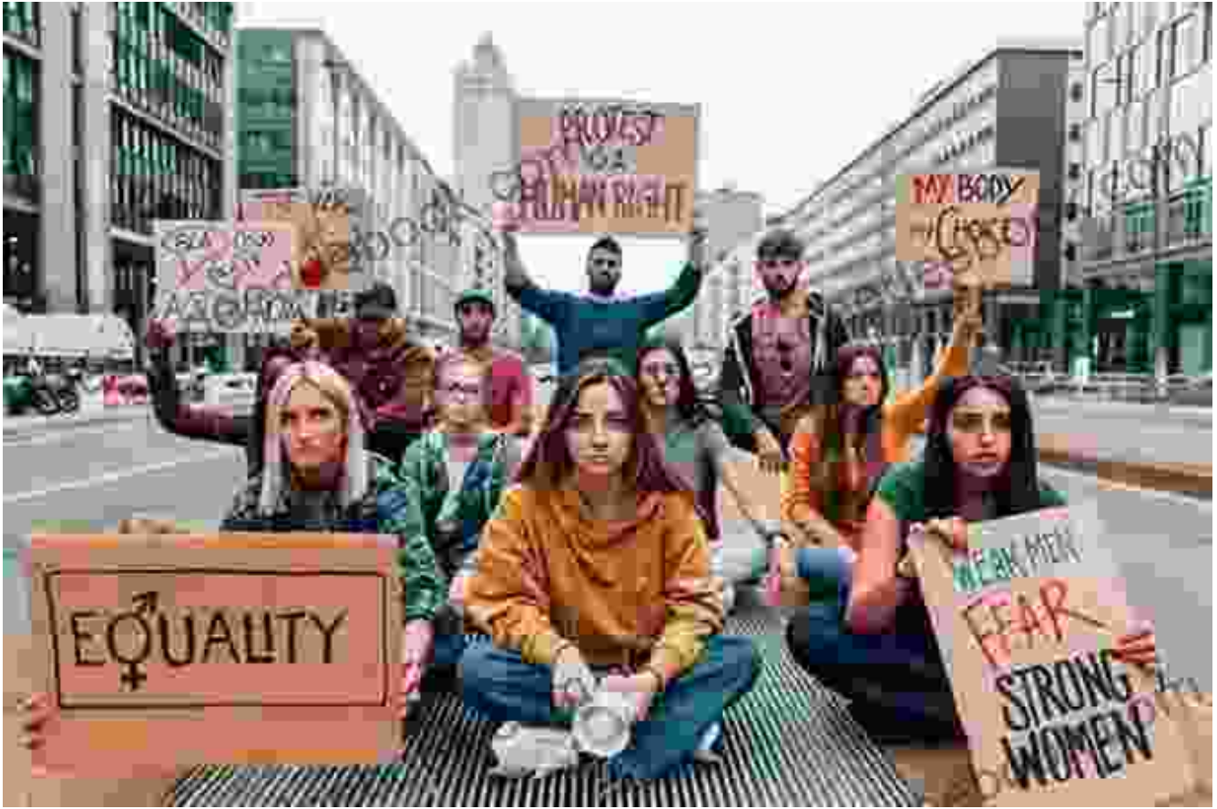
Alison Lyke, "Equal Rights," 2017